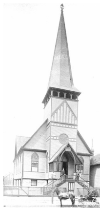
Augustana's original church on Spring Street in Buffalo.

Additional details will be announced soon.